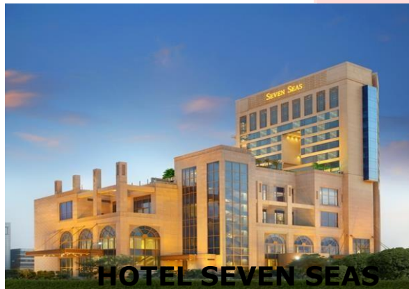
HOTEL SEVEN SEAS